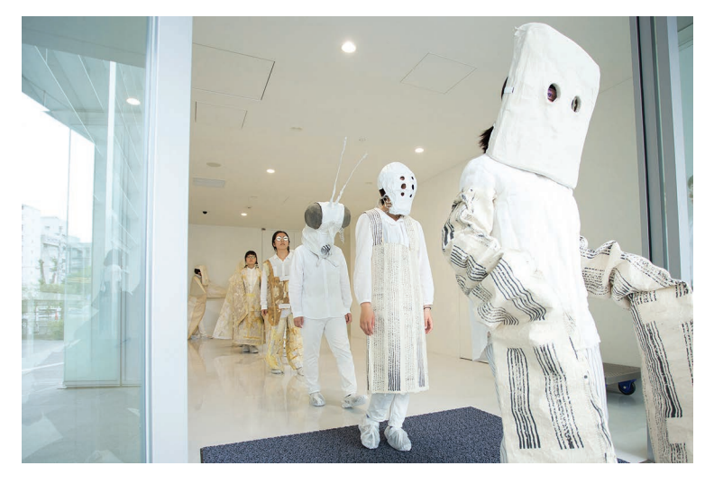
A procession of performers in paper masks and costumes leaving the museum for the streets; as part of Light, Movement and Shadow of My Papersmile, a performance and installation by Tone Fink (with Chantal Dorn) at the Oita Prefectural Art Museum, Japan, 2016.

Showing and seducing, moving and "being" are important for me, that I am alone again when drawing and labeling, painting, and handicrafts. That's why my films are important to me, because I love to present theater to the audience with my creations and make them want to participate. In order to actually constitute oneself as the mobile that unites becoming and being, one must realize in oneself the impression of becoming lighter (becoming an imaginary mass). Think with the body! In order to see, one does not have to stand still.<sup>3</sup>