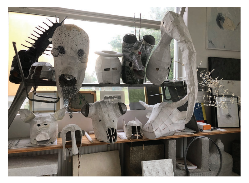
Paper-covered objects for Tone Fink's performance piece, Aufstand der Tiere (Revolt of Animals), a procession that will take place in Schwarzenberg, Austria, July 2020, as part of the town's 750th-anniversary celebration.