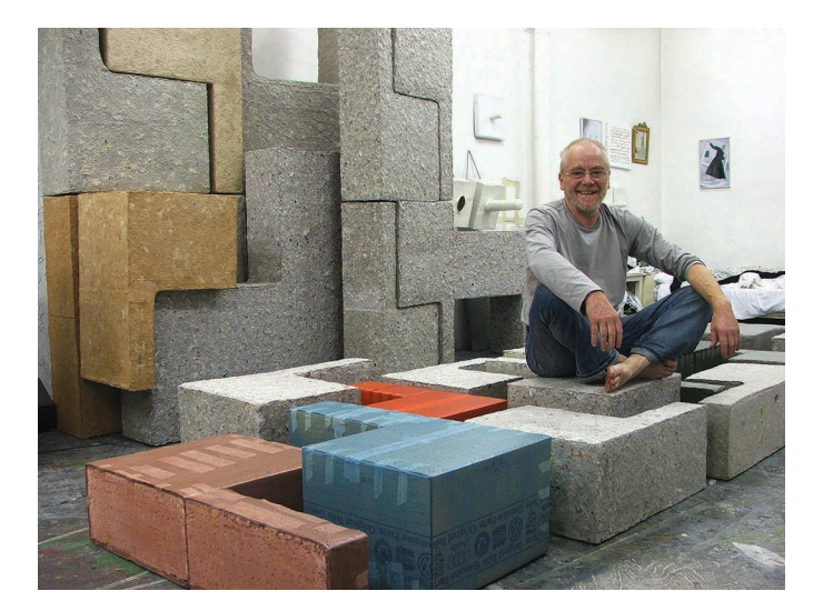
Tone Fink, with Hockthröne (Squat Thrones), 2004–2006, wood, papier-mâché.